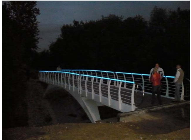
Bridge picture above: Moscow Park "50-years Anniversary of October revolution". Bridge by Apatech, Russia and Light Weight Structures, Netherlands. Length of bridge 22.6 M1, width of bridge 2.5 m1. Installation: July 2008.

COBRAE – Composite Bridge Alliance Europe www.cobrae.org